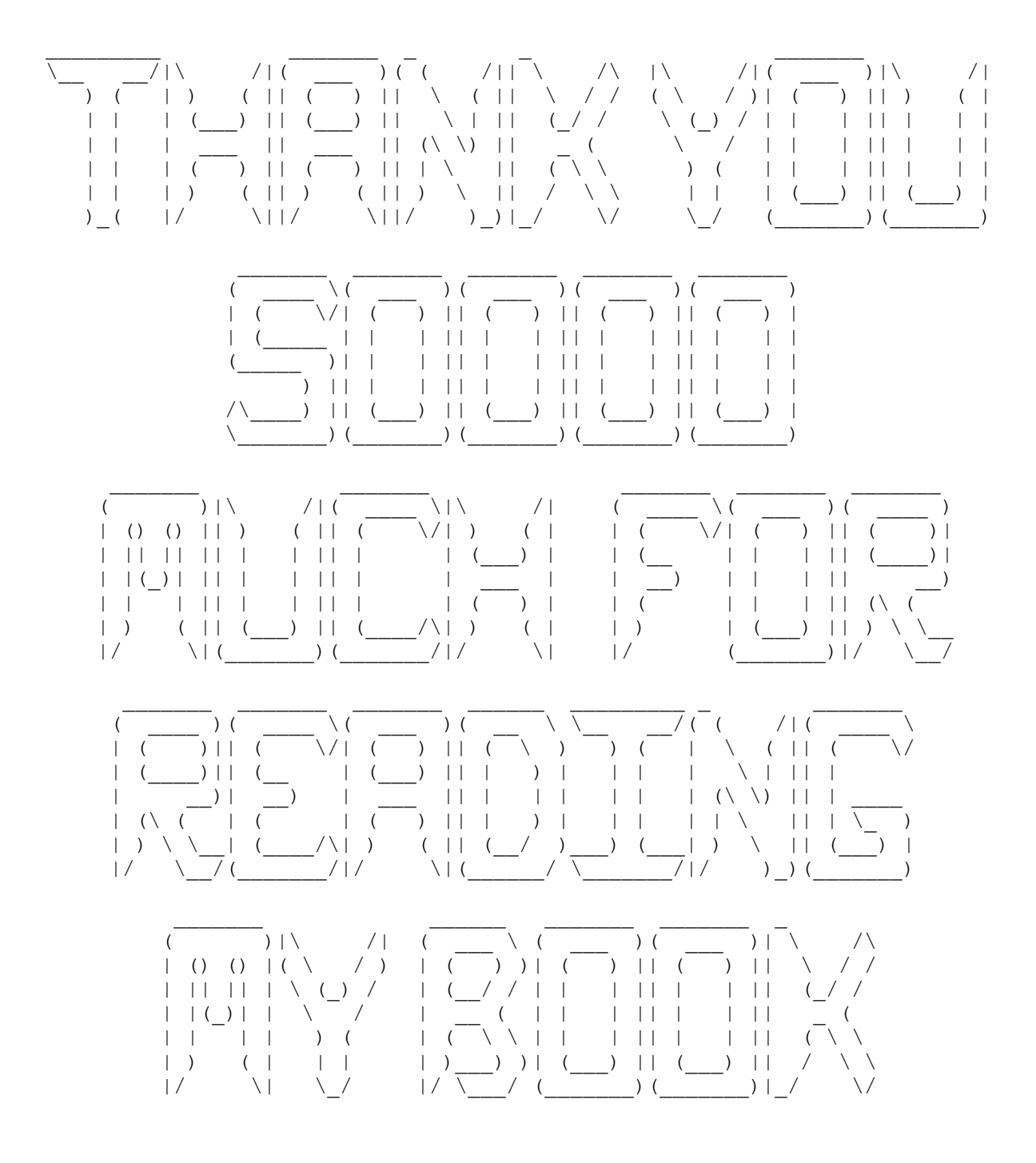
I love you.